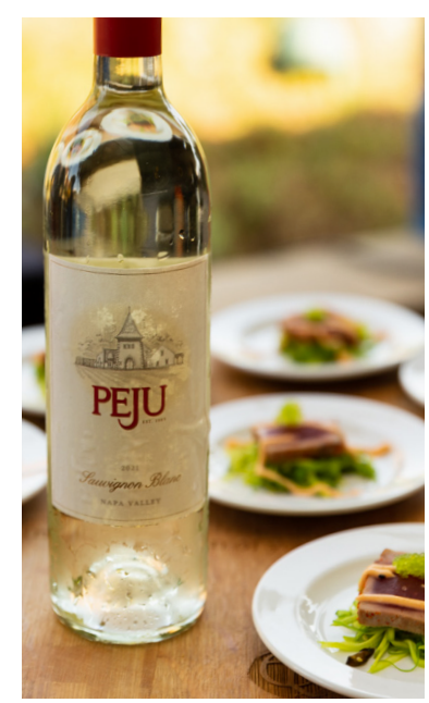
Peju Province Winery