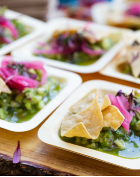
Copita Spring Ceviche