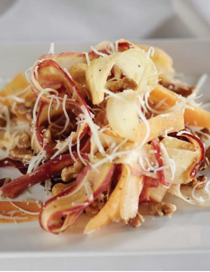
Root Vegetable Salad, Insalata's