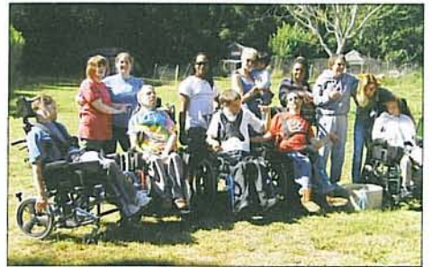
Above, top: The Week of Caring Crew from Fireman's Fund Insurance Company and Redwood Credit Union. bottom: The staff and clients from Nova and Sun II enjoy their trip to Inverness.