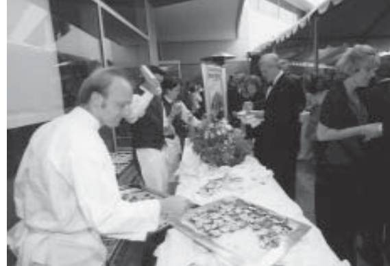
Martinis and Oysters Bingo from Buckeye Restaurant are always a bit with the guests at the Great Chefs of Marin. See more about the event on pages 1, 4 & 5.