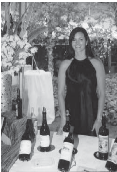
Duckhorn Winery (right) was one of the several new wineries that poured this year at the Great Chefs.

il 30, 2005 onorary Chairman ster of Ceremonies , Culinary Host