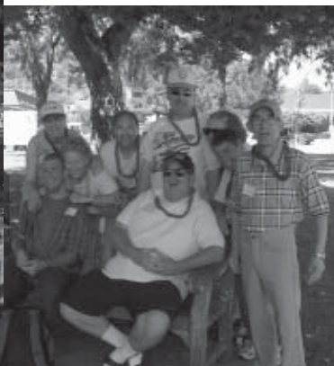
Over 200 clients, family, staff and friends were on hand for the picnic.