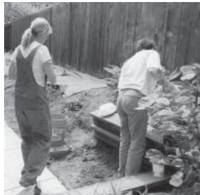
Which led to the side of the house (above) ...and the front of the house (right).