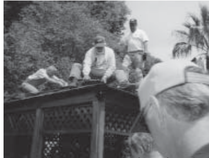
It started with a request to fix the gazebo roof....

Our wish list included items such as landscaping the front yard, fixing a gazebo, painting and repairing fences and upgrading cabinets, walls and fixtures inside. All repairs were made possible