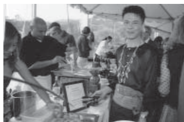
This year, Kitti’s Place served Fresh Soft Spring Rolls with Prawns and Plum Sauce