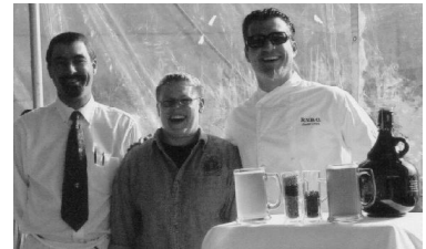
Ross Valley Brewing Company proudly shows off its brews. The restaurant also served Crispy Polenta with Wild Mushrooms, Toasted Hazelnuts and Organic Baby Arugula.